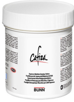
CLEANING TABLETS, CAFIZA 100T